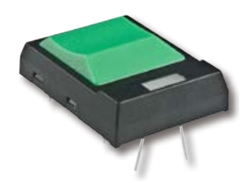
JF Series spot illuminated tactiles will have LED revisions.

1. The LED specifications for JF Series spot illuminated tactile switches will be undergoing changes. This will result in revisions to the electrical values, and will apply to red, yellow and green LEDs for standard or custom switches. Following is the comparison between the specifications before and after the changes. Effected standard part numbers are on page 2.