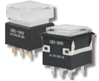
UB2 Series with Super Bright Blue LED Have Changes

The Super Bright Blue LEDs for UB2 Series pushbutton switches and indicators will be changing. Both standard and custom pushbuttons and indicators are included in the revision. The change will effect electrical specifications, which are compared below. It will also effect the LED terminal dimensions and terminal plating, displayed on page 2. Part numbers for effected standard switches and indicators are shown on page 3.