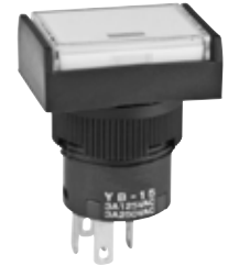
YB Pushbutton with Spot Illumination

The manufacturer that furnishes LEDs for YB spot illuminated pushbutton caps is changing. The replacement LEDs will include 2-volt (without resistor) for Red or Amber; 5-volt for Red, Amber or Green; 12-volt for Amber; 24-volt for Green or Red/Green bicolor.